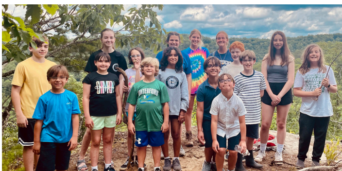
Choristers at our 2022 Choir Camp